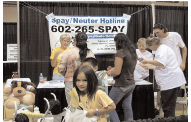
ADLA Spay Neuter Hotline Table at Community Health Fair, September 2007

ADLA greatly appreciates the volunteers that helped at these events. If you are interested in tabling at upcoming events please email adla@adlaz.org (Spanish-speaking volunteers especially needed). Volunteer opportunities are listed on ADLA's online calendar. More photos are posted on the ADLA Photo Gallery at www.adlaz/gallery.html .