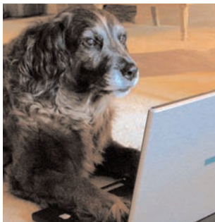
Buster the Blogger

ADLA's administrative office has moved from Tucson to Phoenix. We will continue to receive mail in Flagstaff and Tucson, but please send donations and general correspondence to our Phoenix address.