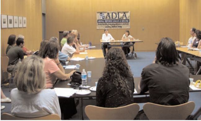
ADLA Quarterly Meeting - September 2007