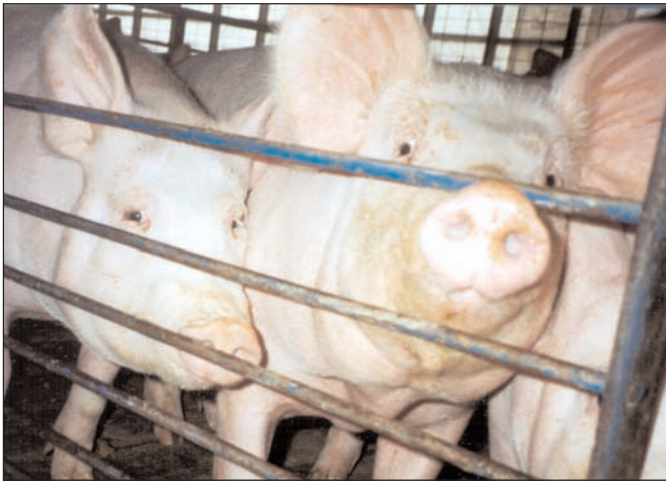
Pigs raised on factory farms are confined in metal and concrete pens. They live here until they reach slaughter weight of 250 pounds at six months old.

C ullison Farms LLC and Pigs for Farmer John (PFFJ LLC) are back to square one in their quest to build an industrial hog operation in Yuma County, Arizona.