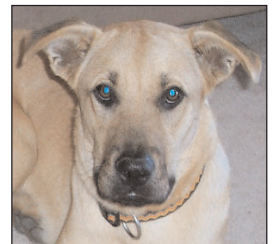
"Milo"

expanded additional efforts on behalf of animals and voting rights. Although the animal protection measures failed to pass, we appreciate the efforts of those who introduced and supported humane legislation.